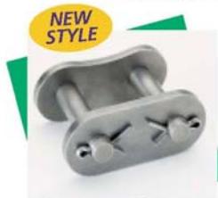
Full Strength Connecting Link

HKK's newly designed full strength connecting links are now standard. Size 35 through 240* connecting links have 20% higher fatigue strength than conventional connecting links. This added strength equals the fatigue strength of the chain allowing for maximum allowable loads.